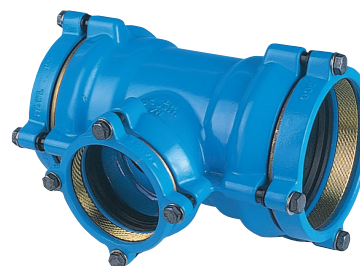
Тройник раструбный № 8515