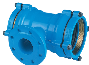
Тройник раструб-фланец № 8525